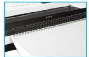
Special device for wire hanging