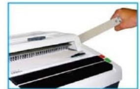
Device for wire closing