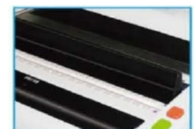
Single paper slot for two binding types.